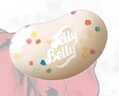
BIRTHDAY CAKE OF DIRTY DISHWATER