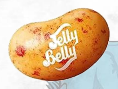
STRAWBERRY BANANA SMOOTHIE or DEAD FISH