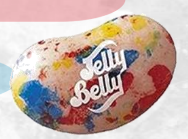
TUTTI FRUITTI or STINKY SOCKS