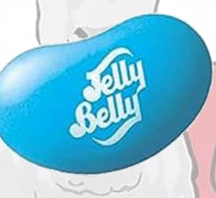
BERRY BLUE or TOOTHPASTE