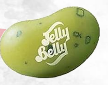
JUICY PEAR or BOOGER