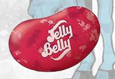
POMEGRANATE or OLD BANDAGE