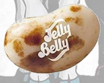
MARSHMALLOW or STINK BUG