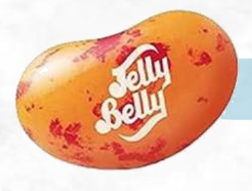
PEACH or BARF