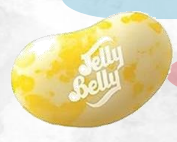
BUTTERED POPCORN or ROTTEN EGG