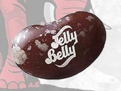
CAPPUCCINO or LIVER & ONIONS